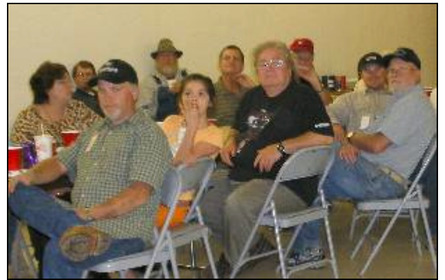
Members at the fund raiser auction

A silver half dollar has been hidden in the trees at Driller Park in Kilgore. Can you be the one to find it?