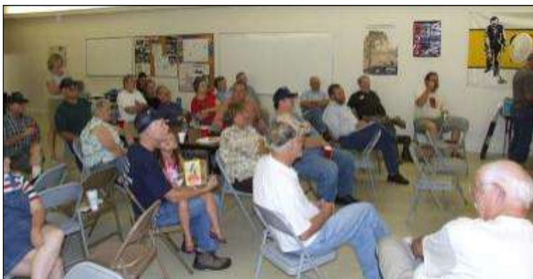
Club members enjoying last month's fund raiser auction.