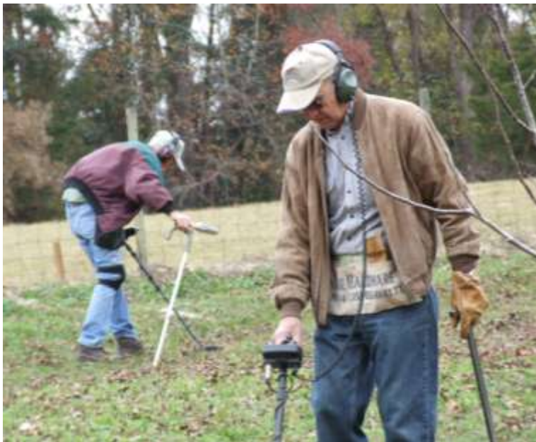
Club members enjoy the seeded club hunt at the St. Clair's.