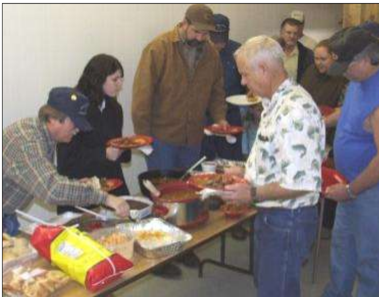
Serving line at the Christmas Party dinner.

Rusk County Treasure Hunters Association members shared the traditional dinner before exchanging gifts at the December meeting and Christmas Party.