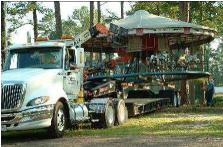
Carousel being loaded onto low-boy trailer.