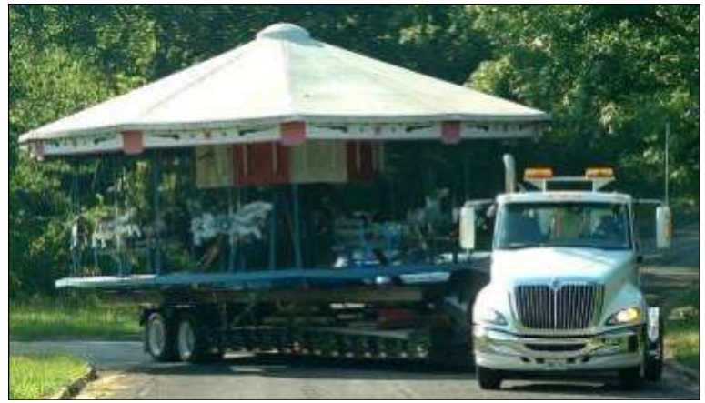
Leaving the Park