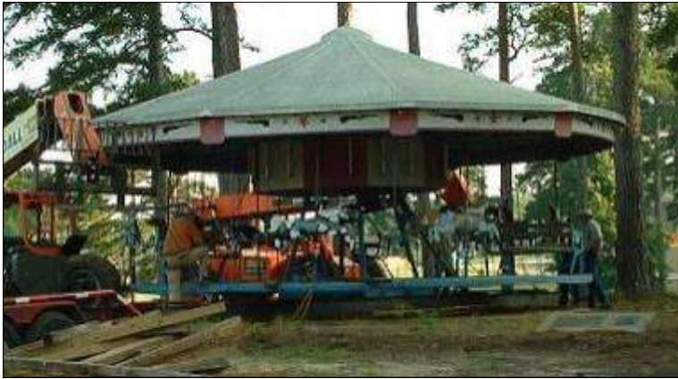
Workers preparing to lift the carousel for its move to the Depot Museum.