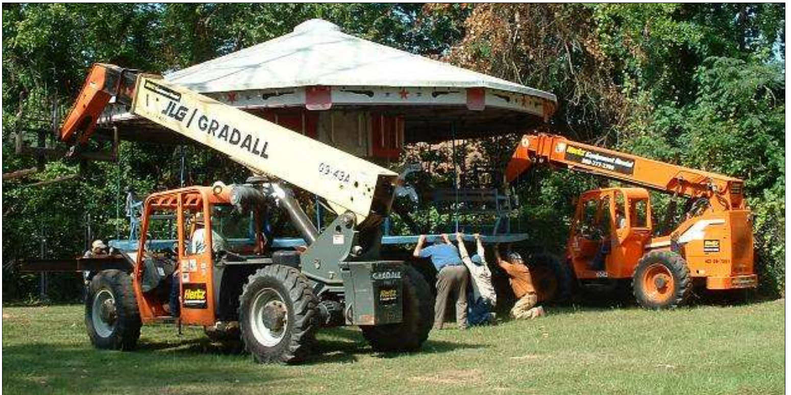
The carousel being set down at its new home at the Depot Museum Grounds

We seriously need to consider enlarging our sandbox this year. Doubling the size would be appropriate since this would allow more kids to be in the hunt area at one time. If you have helped in the sandbox for the past few years, you realize how crowded it gets with RCTHA volunteers assisting each child as they hunt for treasures. A few more boards and stakes would be all it would take to construct a larger area. Be thinking about this sandbox enlargement suggestion for the upcoming November Syrup Festival. With the carousel in such close proximity to the RCTHA booth, it's almost a given that more kids will be visiting our sandbox this fall.