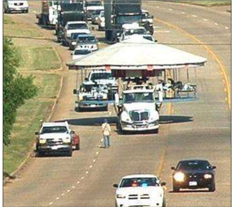
Wonder what the kids were thinking who saw this on the highway?

If you are like me, you can't help but wonder what treasures lie buried around the area where the old carousel has stood in Lake Forest Park all these years. Unfortunately, there is a city ordinance prohibiting excavating in all Henderson city parks which pretty much kills any hope of enjoying our hobby in these parks. This is even more unfortunate considering a recent headline in the local Henderson newspaper regarding the cost of cleaning up graffiti on park facilities. What better way to discourage graffiti than to have people in the park using the facilities? If we were allowed to metal detect in the city parks there would be a much better chance of someone (a metal detectorist) being there to discourage this type of senseless defacing of our city facilities.