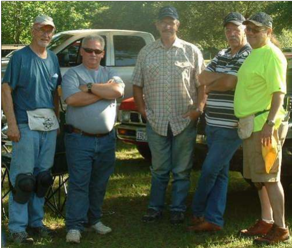
Club members stop their pre-hunt socializing long enough for a quick picture to be taken.