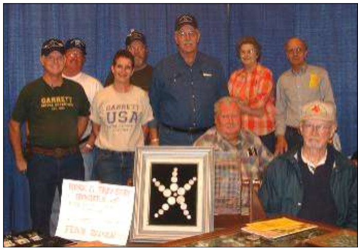
RCTHA members at the 2009 TCTC Show.