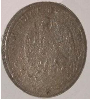
1844 Eight Reale Coin