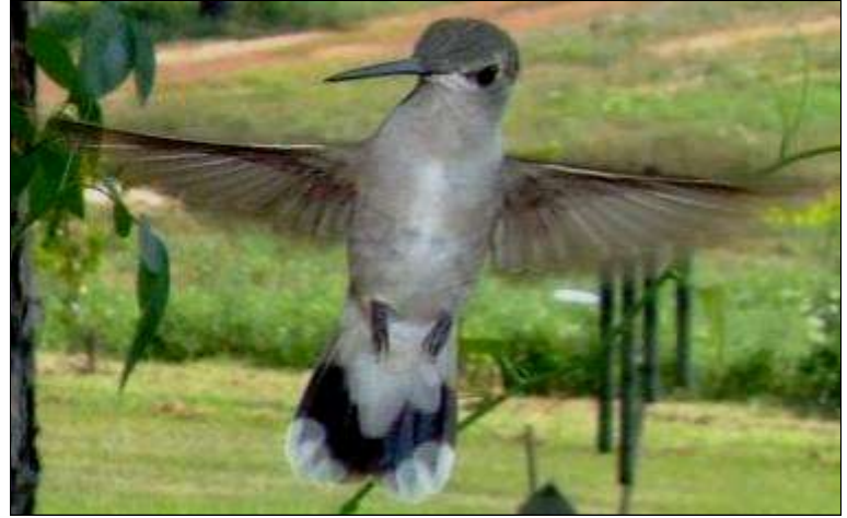
What do you do when it's too hot to get out and detect? You grab your camera and snap some shots of the hummingbirds around your feeders.